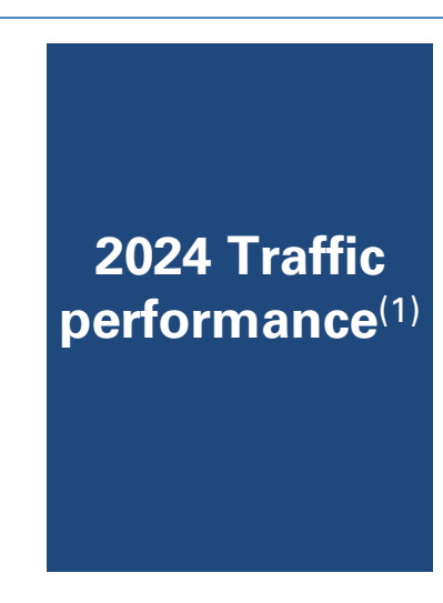
Jan - Mar 2024 vs 2023